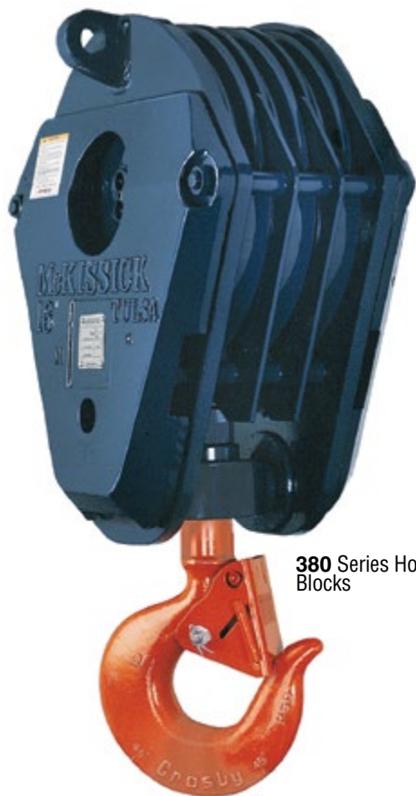
380 Series Hook Blocks